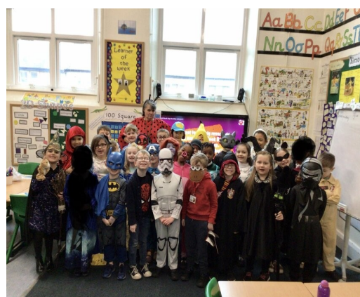
Celebrating World Book Day