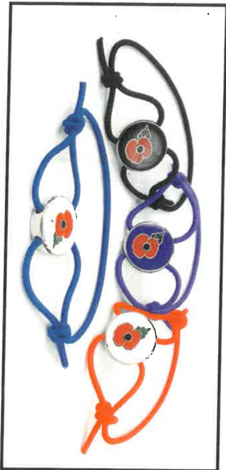
Friendship Bracelet - Suggested Donation: £1.00