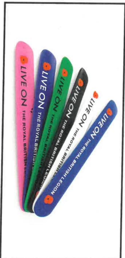
Snap Band - Suggested Donation: £1.00