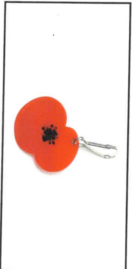
Reflector - Suggested Donation: 50p