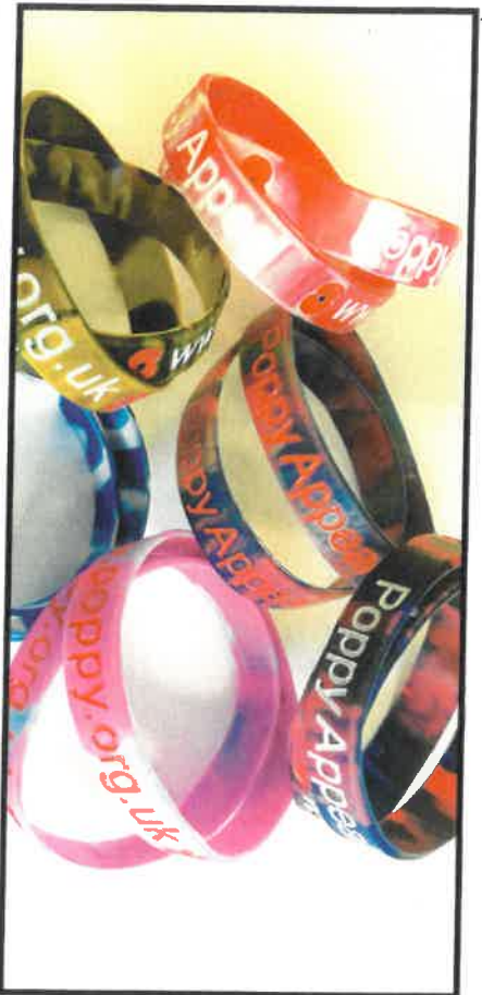
Wristband - Suggested Donation: 50p