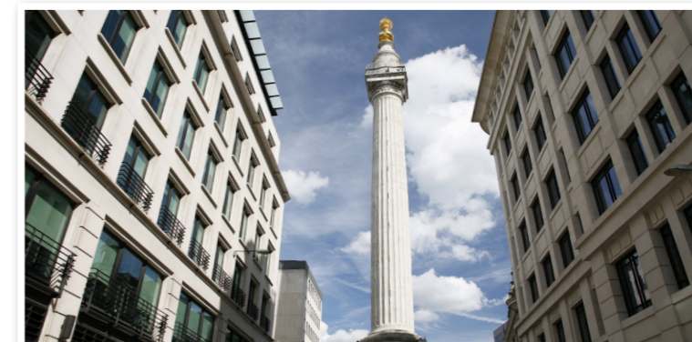
Monument to the Great Fire of London

The Great Fire of London was a significant event in London's history. It began in a bakery on Pudding Lane on Sunday 2nd September, 1666. Many buildings were destroyed including St Paul's cathedral. Today, a monument stands where the fire began.