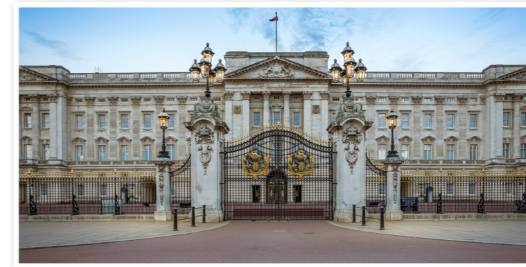
The Queen lives at Buckingham Palace.

Queen Elizabeth II is the current monarch of the United Kingdom. She was born in 1926 and became Queen in 1952. The Queen is famous across the world.