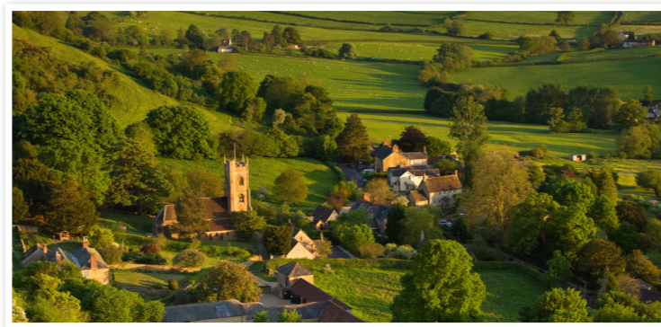
Village of Corton Denham in Somerset

The countryside is a rural area outside of a town or city. Less people live and work in the countryside than in a city.