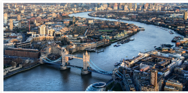
City of London

A city is a large urban settlement with lots of traffic and tall buildings. There are many shops and restaurants to visit there.