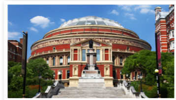
Royal Albert Hall