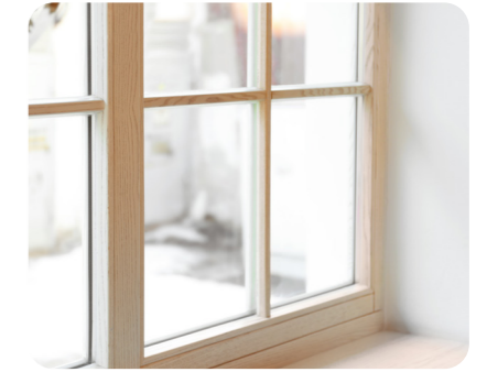
A glass window is hard and transparent.