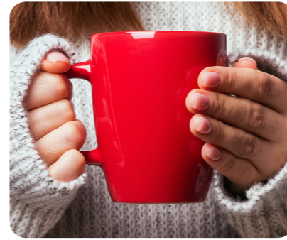
A ceramic mug is hard and waterproof.