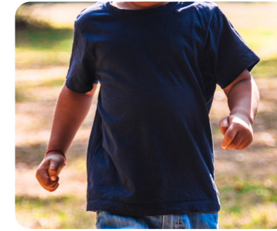
A cotton T-shirt is soft and stretchy.