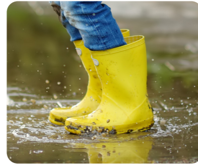
Rubber wellies are waterproof and bendy.