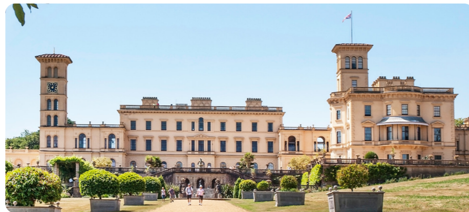
Osborne House is on the Isle of Wight, England.