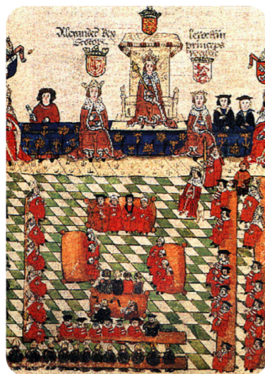
Edward I and the Model Parliament

The power of the monarchy has changed over time. In the past, some monarchs had absolute power. This meant that they could do whatever they wanted. Today, there is a constitutional monarchy. This means that the monarch is controlled by parliament and the government.