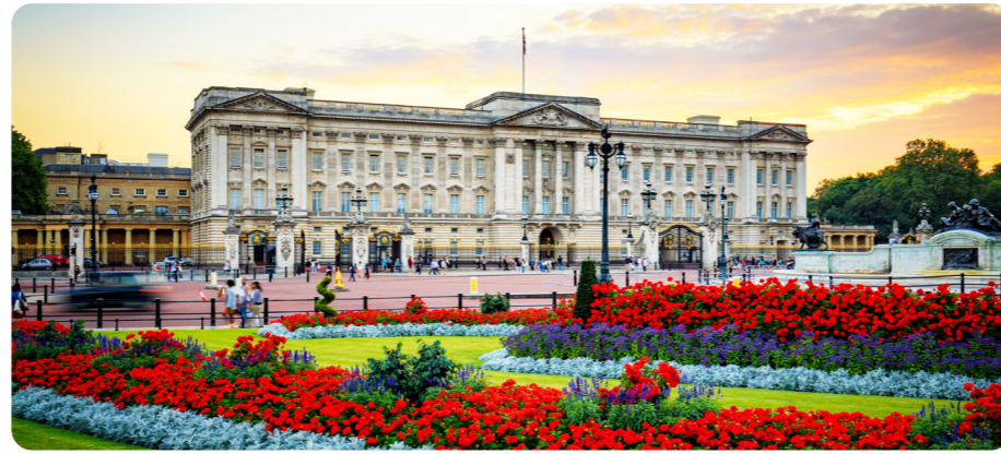
Buckingham Palace is in London, England.

Royal residences include palaces, castles and stately homes. Some of them are used for official royal business. Some are used as holiday or private homes. Many are tourist attractions.