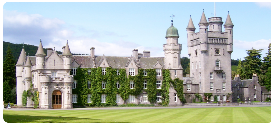
Balmoral Castle is in Aberdeenshire, Scotland.