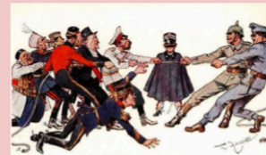
A cartoon from 1914 showing the pre war alliances