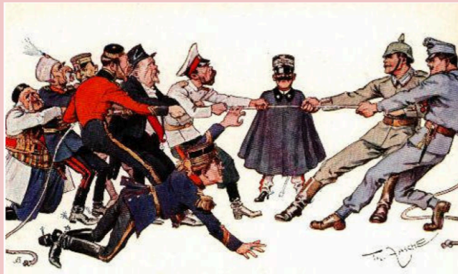
A cartoon from 1914 showing the pre war alliances

You can annotate (label) the source to help you