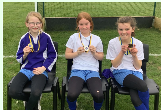
YEAR 5 Winners

"Let your light shine before others" Matthew 5 v 19