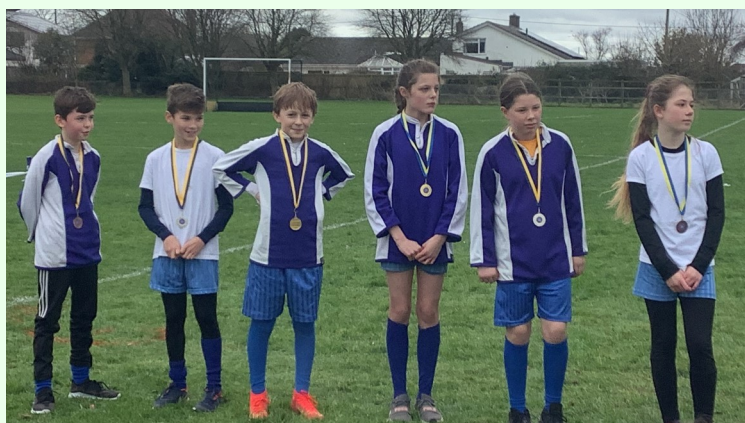
YEAR 6 Winners