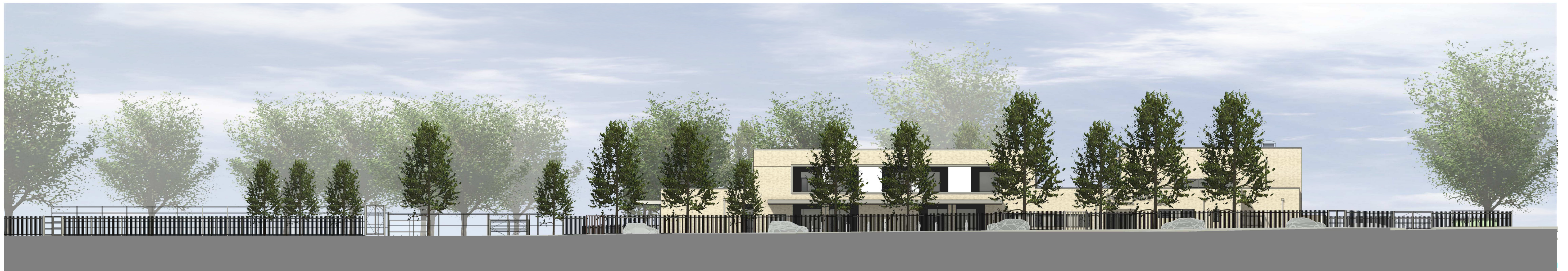
Streetscape 1 : 200