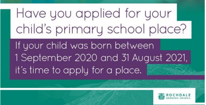
CLOSING DATE 15<sup>TH</sup> January 2024. You must apply for Primary School place through the council website