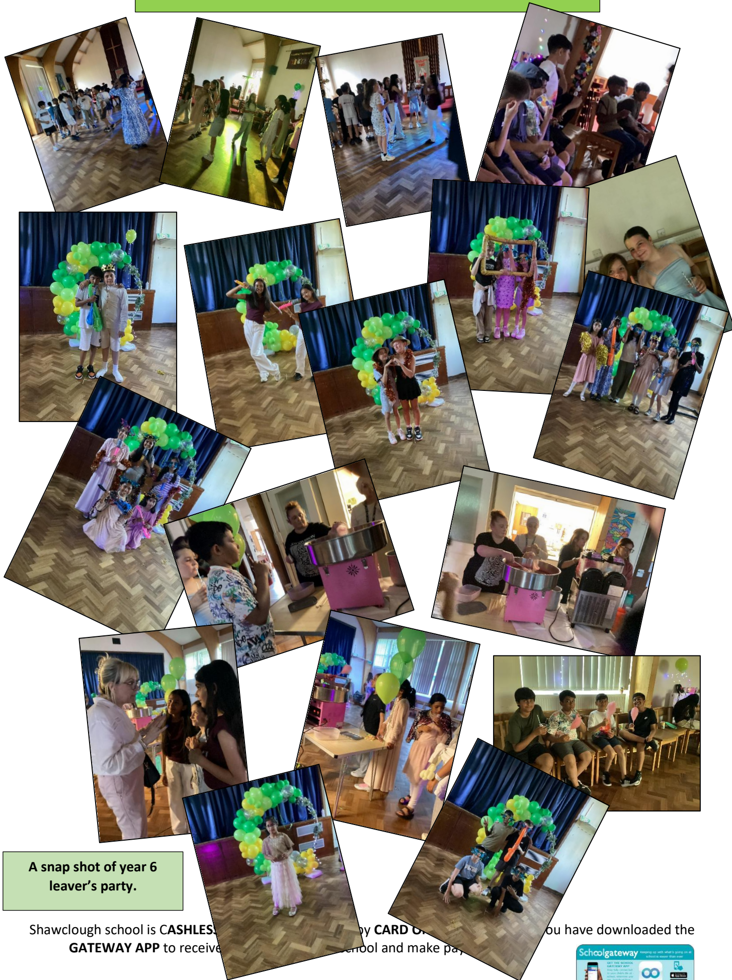
A snap shot of year 6 leaver's party.

Shawclough school is CASHLESS. You can pay by CARD OR you have downloaded the