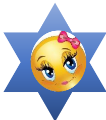
Reception Blue Imogen Higgins