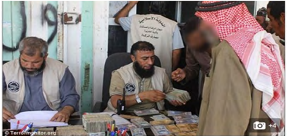
Charity? The propaganda shots show jihadis handing out cash to members of the public at a dole office

Propaganda from Daesh: An example shown here is captioned, "Charity? Jihadis handing out cash to members of the public at a dole office". Daesh's cause is in no way charitable and has led to many lives lost, including more Muslims than non-Muslims.