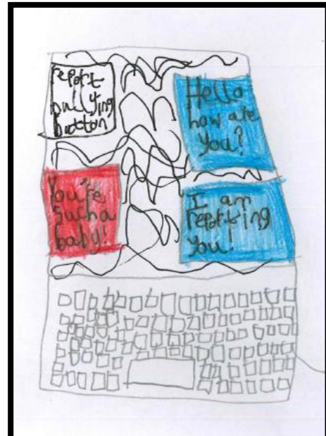
Ben - Pegasus

Verbal bullying: being teased, name calling and rude comments.