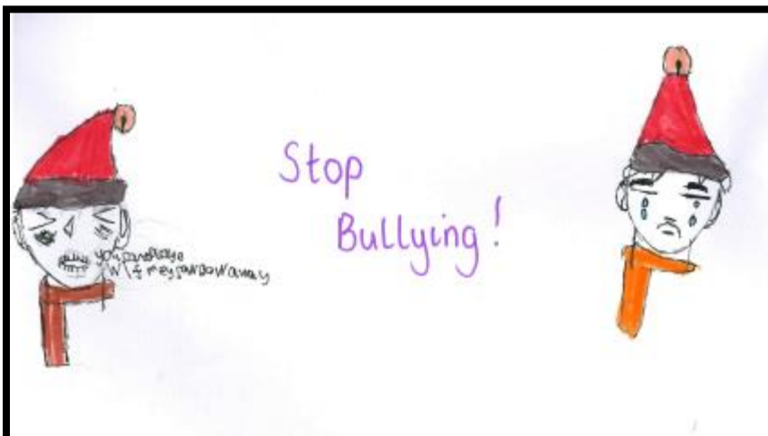
Dantai - Dragons

Verbal bullying: being teased, name calling and rude comments.