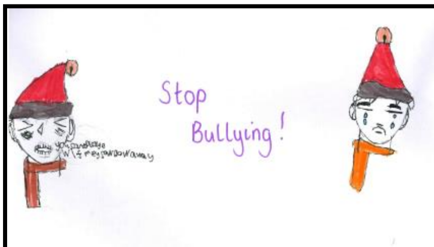
Dantai - Dragons

Verbal bullying: being teased, name calling and rude comments.