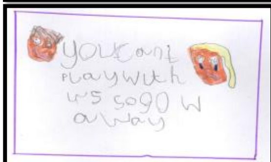
Rhylei - Dragons