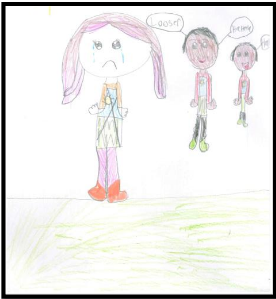
Isobel - Minotaur

Emotional bullying: hurting people's feelings, leaving you out and being bossed around.