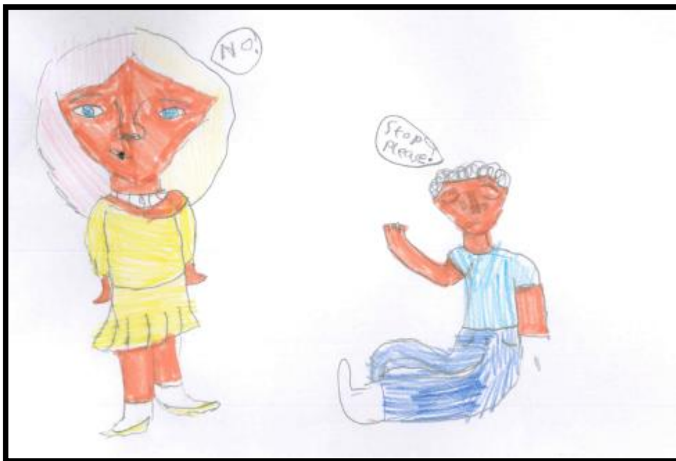
Miah - Minotaur

Physical bullying: punching, kicking, spitting, hitting, pushing.