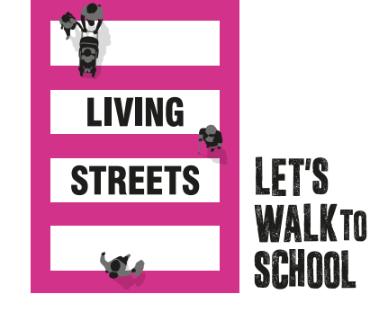
WALKING ACTIVITIES FOR PRIMARY SCHOOL-AGED CHILDREN