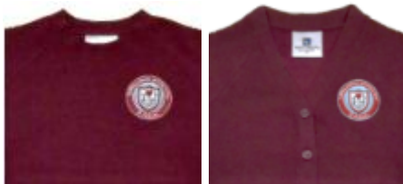
Maroon jumper or cardigan