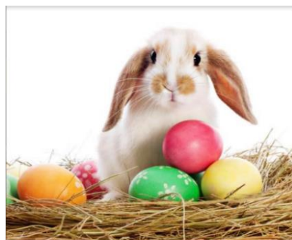
SAT, 1 APR AT 10:00 Coffee Morning & Easter Raffle