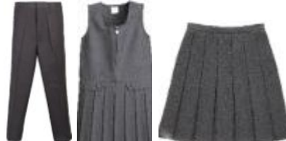
Grey long trousers, Grey pinafore or skirt