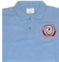
Pale blue polo shirt