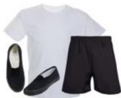
White t-shirt, black or navy PE shorts and black pumps