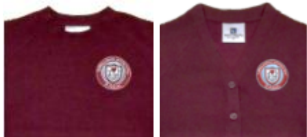
Maroon jumper or cardigan