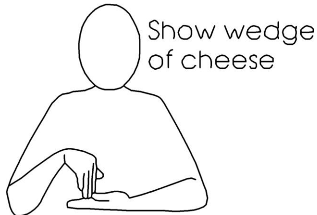
4 - This Week's sign is Cheese