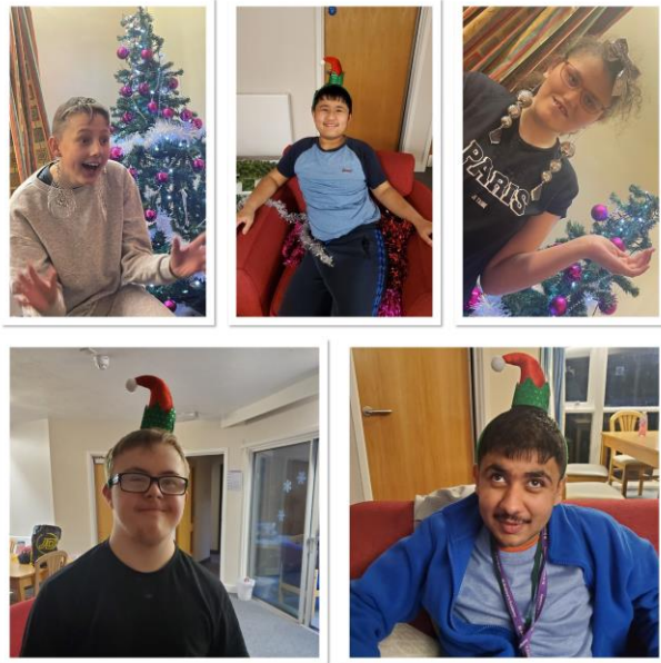
6 - Festive fun and games along the way.