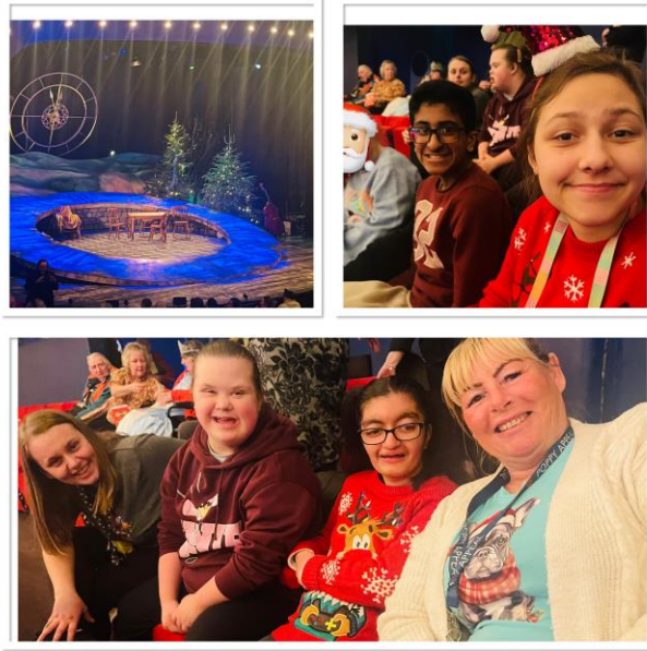
7 - A wonderful, magical and uplifting production of Cinderella at Derby Theatre, with fantastic sets and original songs. Staff and students loved it.