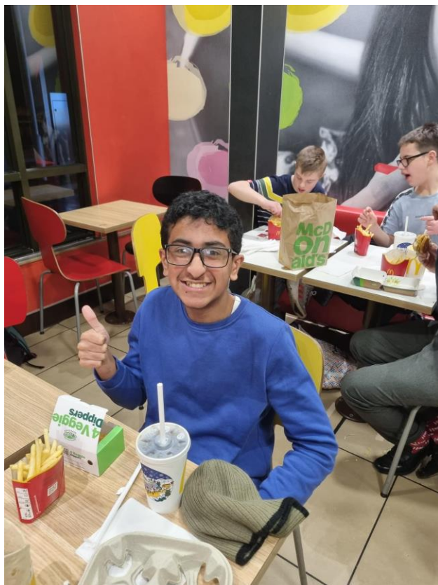
9 - A thumbs up for vegetarian option. "Can we do this every week"