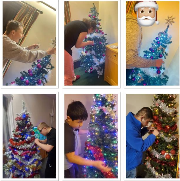
5 - Every student helps decorate the Christmas trees in residential.