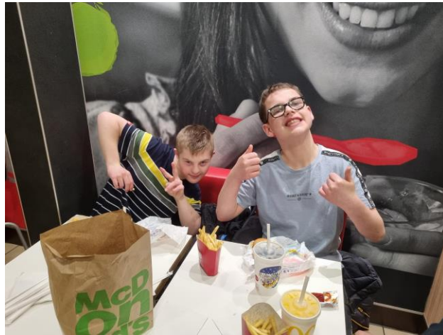
8 - After weeks of cooking our own residential meals, the students were rewarded with a trip out to McDonalds.