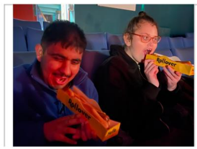
4 - Last weeks visit to watch Wish at Scala Cinema in Ilkeston.