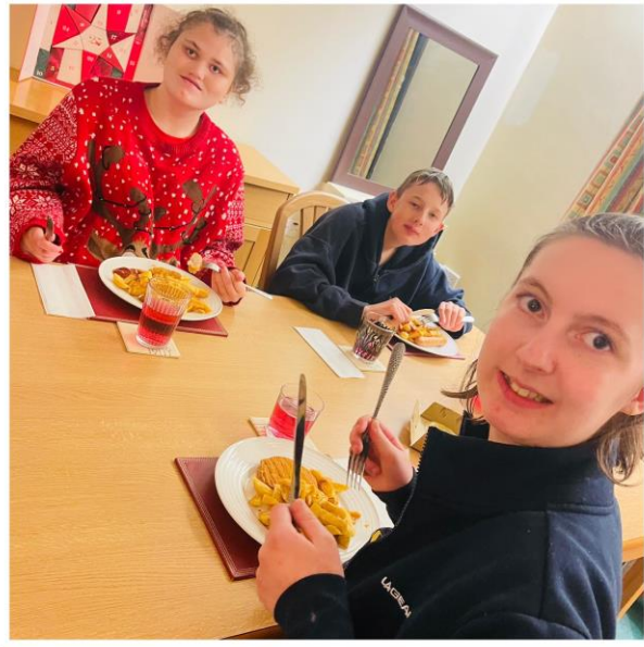
3 - The Tuesday group all enjoyed a treat chippy tea.