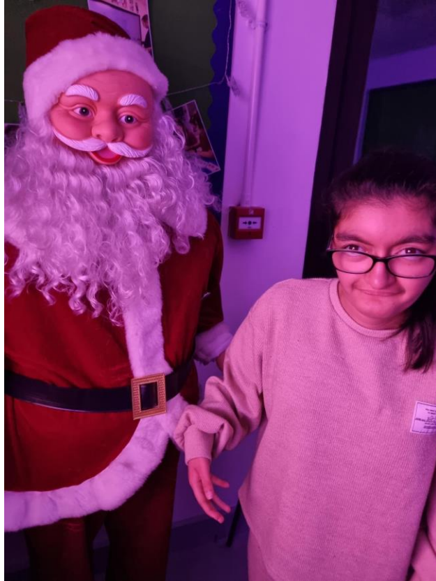
5 - The main man made a special visit to residential to see all the students and deliver a home cooked treat.