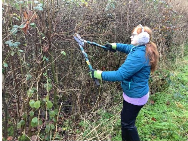
2 - One of our KS5 students busy working with Derby Parks Volunteers in Sinfyn earlier this month.