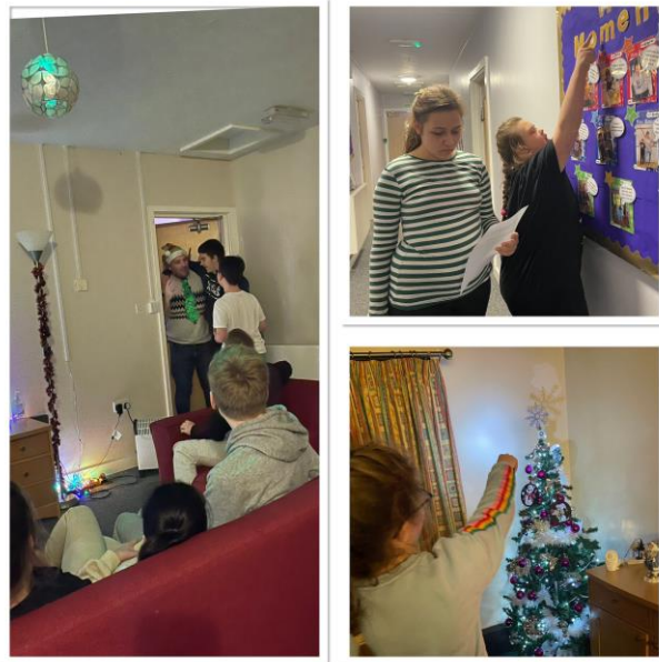
4 - All students used their detective skills during the Christmas scavenger hunt to find Santa. The clues led them to the naughty elf who had stolen Christmas from them.