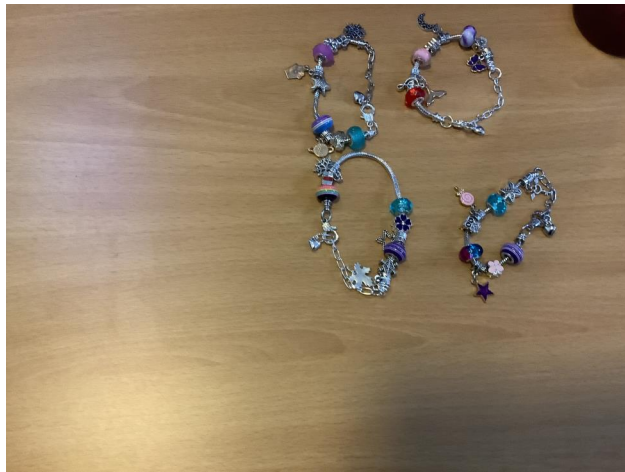
1 - These beautiful bracelets have been carefully designed and beautifully made.