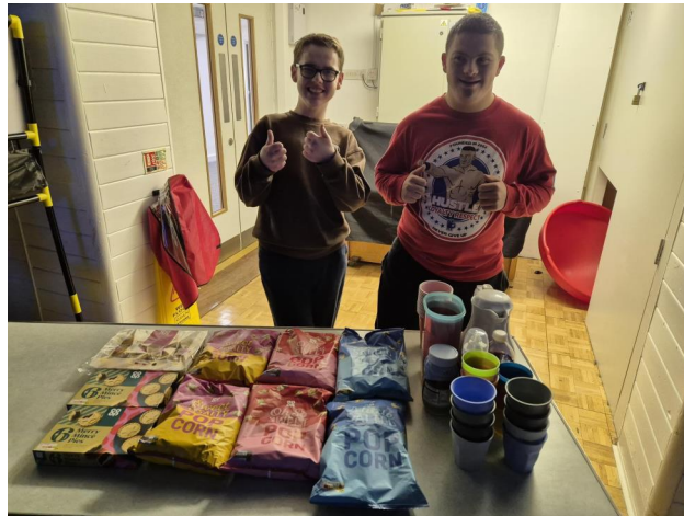
3 - Roll up Roll up, we have some great deals on popcorn today.

Other activities have included a return of Christmas themed Inclusive choir, blasting out many Christmas hits and classic carols. The karate group enjoyed their penultimate session, watching a masterclass demonstration by the Sensei John Johnston.