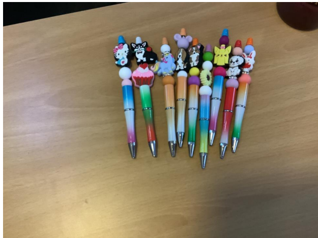
2 - Making opens is a great fine motor skill too, she is hoping Santa brings her more craft things.