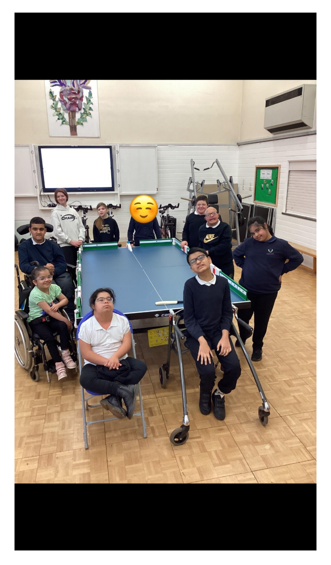
1 - Team St

We hosted our first Multi Sports League fixture against our visitor students from Ivy House for a table cricket match. This event was ran by our very own KS3 St Andrew's Young Leaders. The students welcomed our guests offering them support throughout the game using their leadership skills to ensure they delivered a fun, fair and inclusive game for all players. They took complete control of equipment, scoring, coaching and cheering on both teams. This event was amazing for all staff to see as we witness our incredible young people work together. The smiles and giggles throughout the game was simply amazing to witness. Credit to our opponents Ivy house who left with a win and credit to all players involved as well as our superstar Young Leaders! These events provide not only our students but SEN Schools across derby a chance to come together.