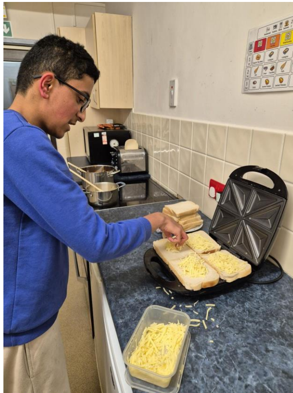
2 - Meal preparation at teatime. Cheese toasties always go down a treat in residential.

Next week Chinese New Year celebrations.