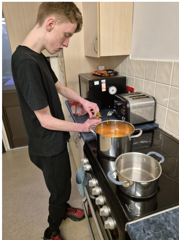
3 - Showing great safety skills in the kitchen when opening the soup tins and using the oven.