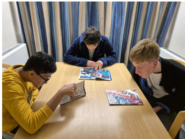
5 - Students reading this weeks new library books with their own self decorated bookmarks.