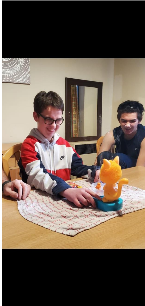
4 - Water splat cat game got all players soaking wet.