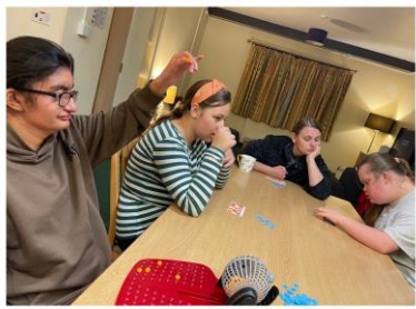
3 - A bingo game practising number recognition and listening skills.