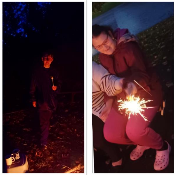
1 - A great evening spent enjoying the activities and lovely food at the DofE evening.