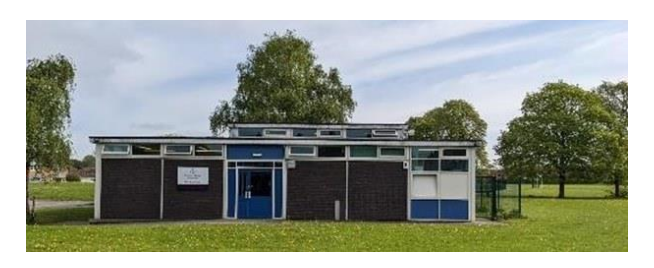
4.00pm – 4.30pm: Campus Tour and 'Meet the Staff'