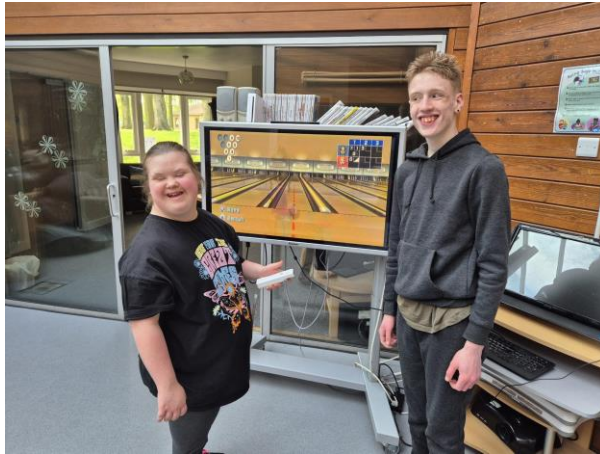
2 - Friends relaxing, and playing their favourite computer game together.