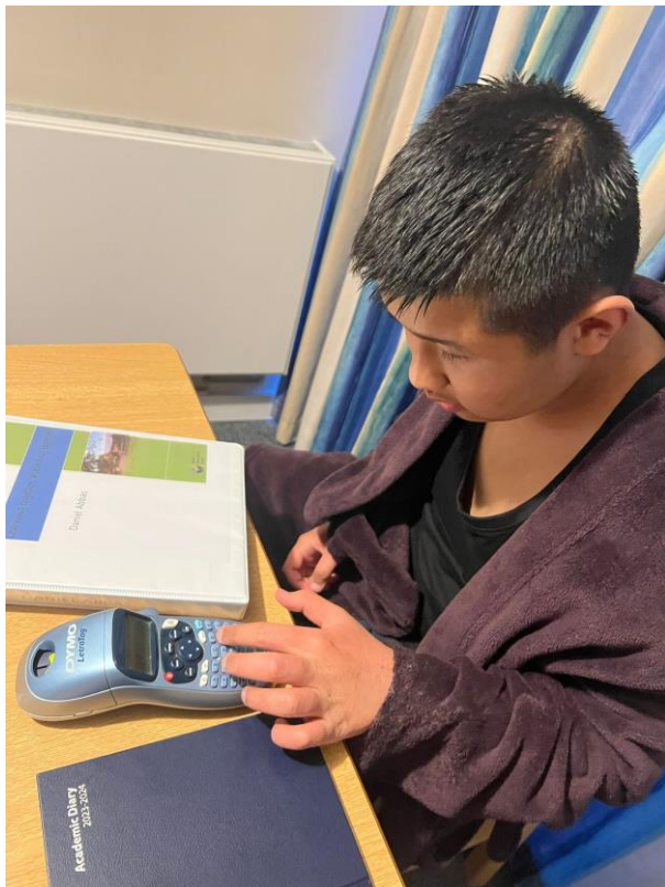
5 - Helping staff with administrative tasks.