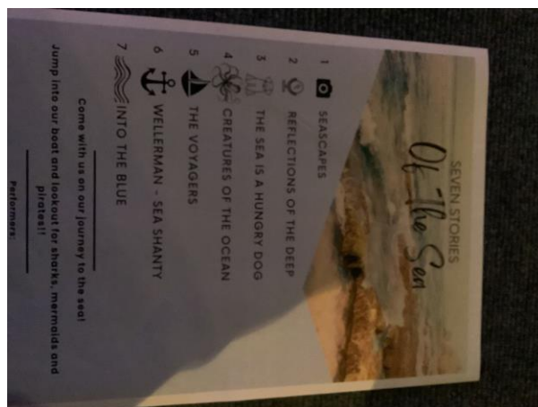
1 - Our programme for the event

We are extremely proud of these students - well done!