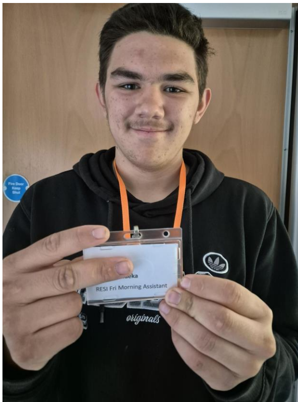
3 - A current residential student who is so proud he has been picked for the position of Friday Morning Assistant. He works very hard in his role completing various tasks with staff support in Residential before school.