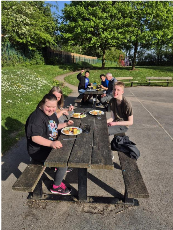
4 - Finally a bit of sun which meant the first al fresco dining event of the summer, hopefully many more to come over the next few months.