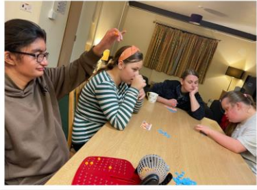
3 - A bingo game practising number recognition and listening skills.