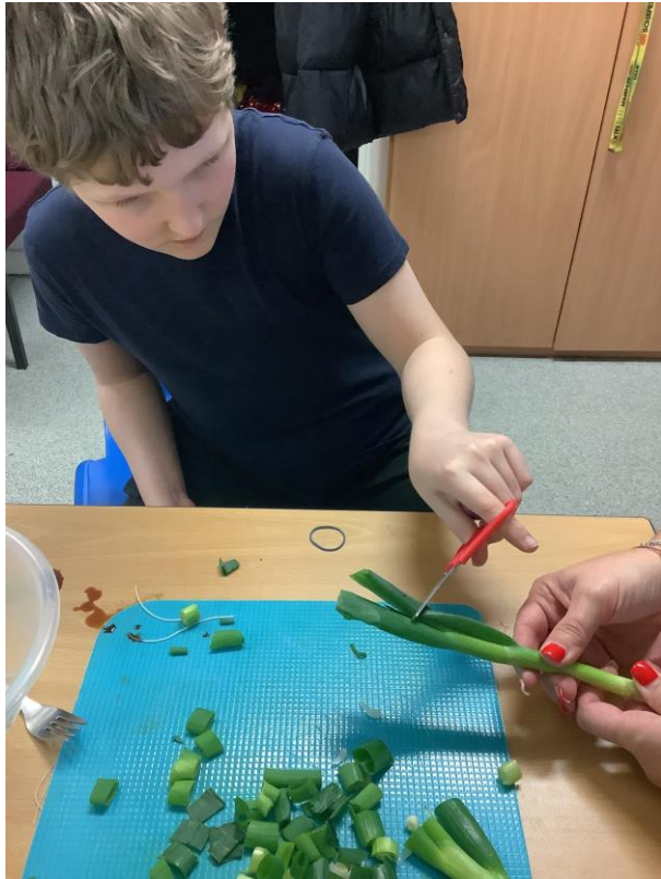
Key Stage 4