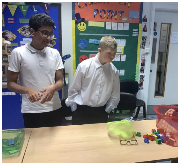
Students in Stronsay class took part in their weekly team challenge. This week the focus was on effective communication. Students had two tasks. They had to build the tallest tower blindfolded, following the instructions of where the blocks were from their peers and for the second task they