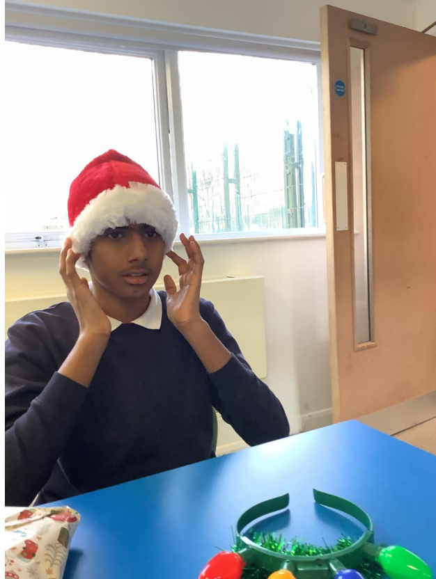
1 - The