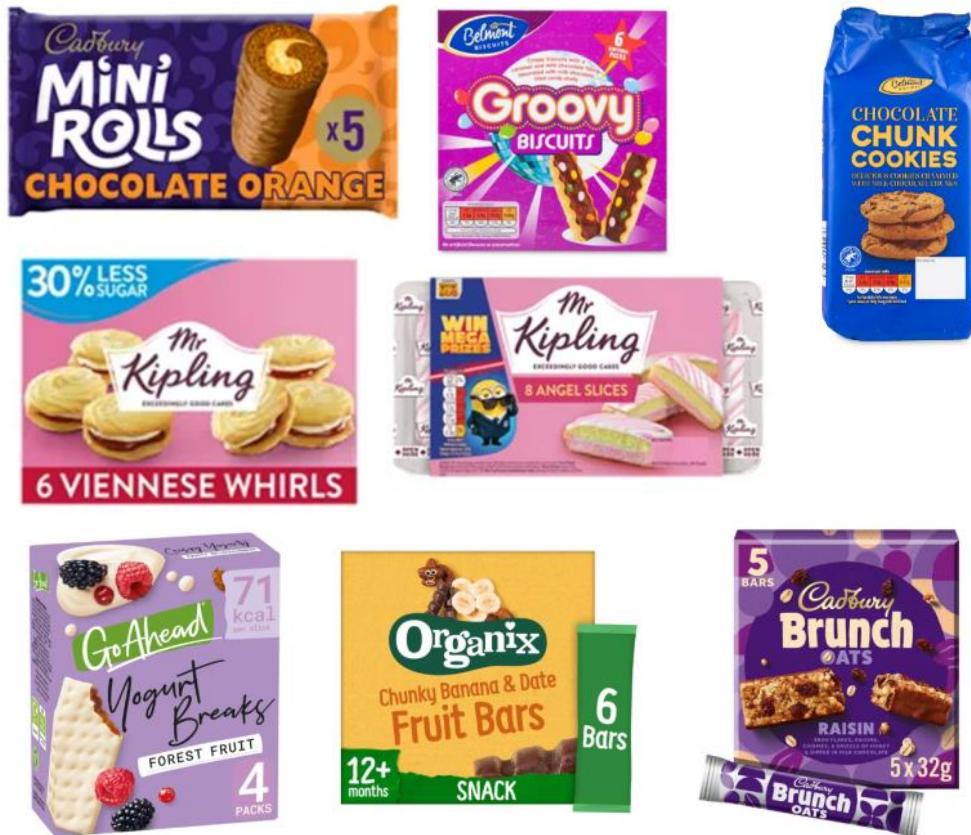
Products that state 'may contain nuts'