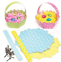
Easter crafts & cards