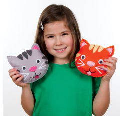
Sew a cat cushion