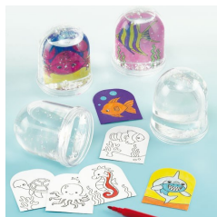
Ocean snow globes