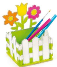
Mother's Day gifts