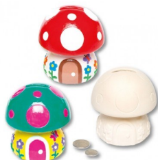
Toadstool money boxes