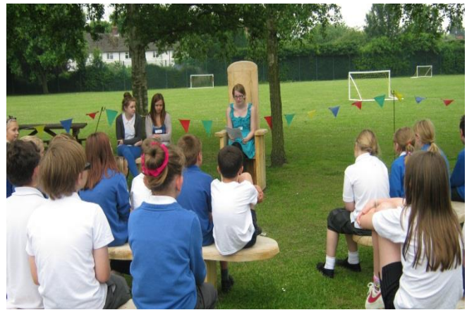
Sixth form students from LWS at St. Andrew's