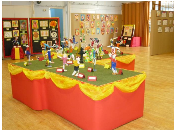
Children's art work displayed in the gallery

There is an opportunity for Year 6 pupils to go on an annual residential visit to Colomendy in North Wales in November. Year 5 pupils visit Youlbury Camp, outside Oxford in September for two nights, as preparation for the Year 6 trip.