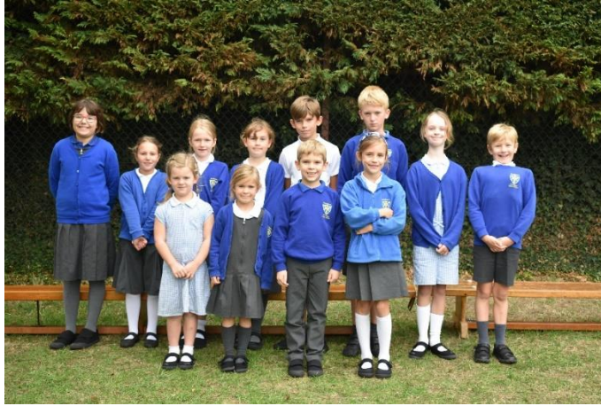
The School Council