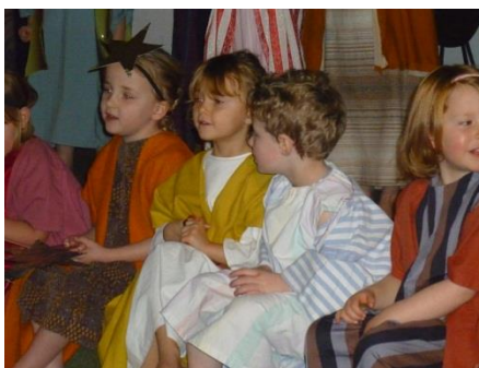
EYFS Christmas play