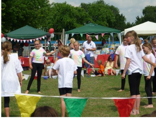
The Summer Carnival