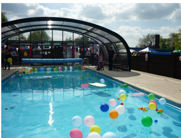
Our Swimming Pool

The Ladybird Pre-school moved into purpose built premises on our site in February 2014. Although the Ladybird Pre-school is run independently from St. Andrew's CE Primary School, we work in close partnership with the pre-school for the benefit of all children and the majority of the children transfer directly from Ladybird Pre-school into St. Andrew's Foundation Stage.