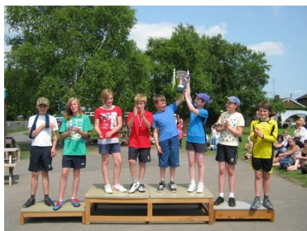
Phoenix House wins Sports Day