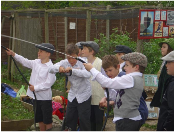
Year 3 visit Lincolnsfield

Musical productions are also a popular feature of our curriculum provision. As well as achieving Healthy School Status and Activemark, we have been awarded Artsmark GOLD for our commitment to the arts – dance, drama, creative writing, art and music.