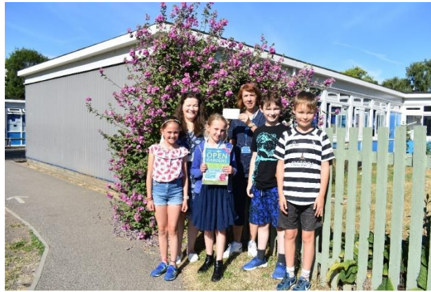
The Gardening Club

These are some of the clubs/activities which have taken place over the last year: Netball, Gardening, Puzzle, Drama, Dance, Choir, Library, ICT, Science.