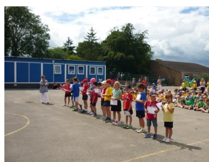
Sports Personality of the Year

St. Andrew's is fortunate to have the Chinnor Community Swimming Pool within the campus. All our children have swimming lessons as part of the PE curriculum from April through to the end of October. The swimming pool is also used by three local schools and community swimming lessons take place after school in the summer months.