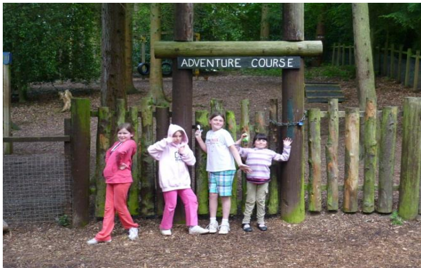
Year 5 at Youlbury, Oxfordshire

There is an opportunity for Year 6 pupils to go on an annual residential visit to Colomendy in North Wales in November. Year 5 pupils visit Youlbury Camp, outside Oxford in September for two nights, as preparation for the Year 6 trip.