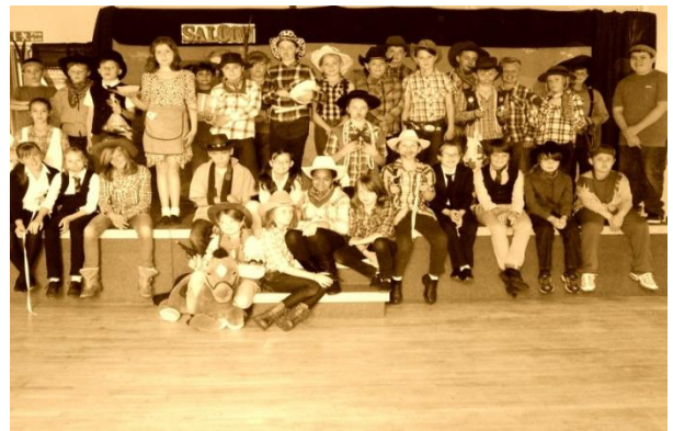
Year 6 production 'Yahoo!'

Year 4 pupils are given the opportunity to become Junior Leaders, taking on a role of responsibility during lunchtimes. Year 5 pupils are offered Play Leader roles at breaktime and at lunchtime. Their role is to lead playtime games and to encourage younger children to join in. In year 6, the children can become Well-Being Ambassadors and support others with any worries they may have in school.