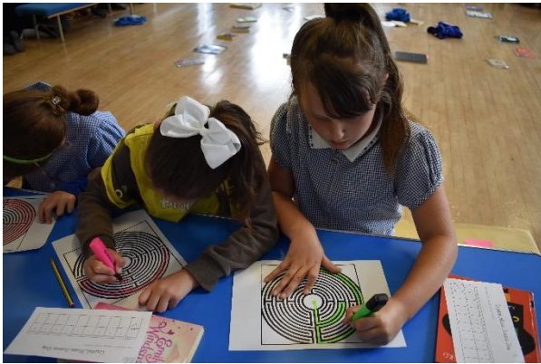
Maths teaching in Key Stage 1