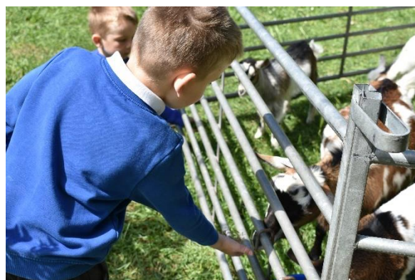
A farm in school