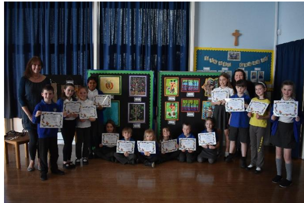
Art exhibition of children's work

As far as possible, we aim to organise our classes into single year groups. However, because numbers are rising due to the school's popularity, occasionally, we may need to have mixed-age groups in the same class. When this does happen, we plan even more carefully to ensure that the work set matches the child's ability.