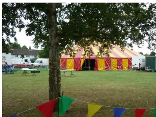
The circus comes to St. Andrew's

The committee are always looking for people to join them or to train as lifeguards. If you would like to help or if you have any questions at all please do not hesitate to get in touch either via the website or by leaving a message at the School Office.