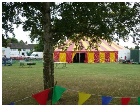
The Circus comes to St. Andrew's