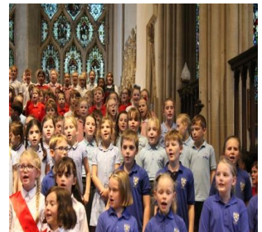
The Choir at Dorchester