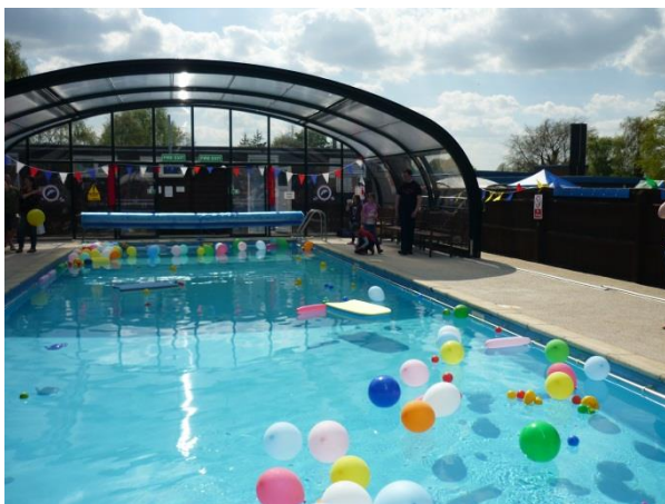
Our Swimming Pool

The Ladybird Pre-school moved into purpose built premises on our site in February 2014. Although the Ladybird Pre-school is run independently from St. Andrew's CE Primary School, we work in close partnership with the pre-school for the benefit of all children and the majority of the children transfer directly from Ladybird Pre-school into St. Andrew's Foundation Stage.