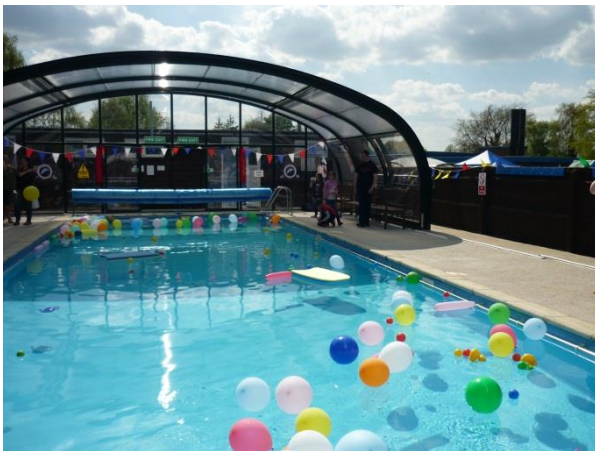
Our Swimming Pool

The Ladybird Pre-school moved into purpose built premises on our site in February 2014. Although the Ladybird Pre-school is run independently from St. Andrew's CE Primary School, we work in close partnership with the pre-school for the benefit of all children and the majority of the children transfer directly from Ladybird Pre-school into St. Andrew's Foundation Stage.