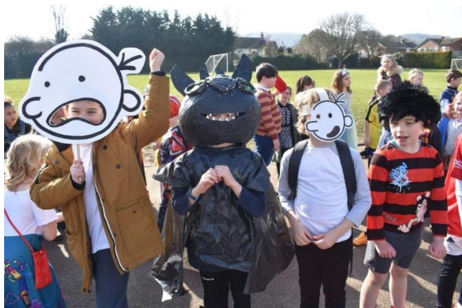
World Book Day