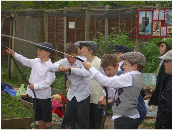
Year 3 visit Lincolnfield

Musical productions are also a popular feature of our curriculum provision. As well as achieving Healthy School Status and Activemark, we have been awarded Artsmark GOLD for our commitment to the arts – dance, drama, creative writing, art and music.