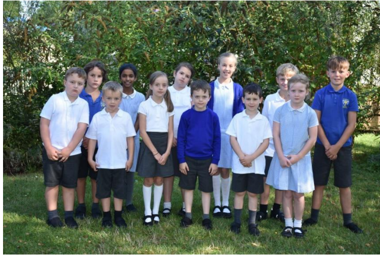
The School Council