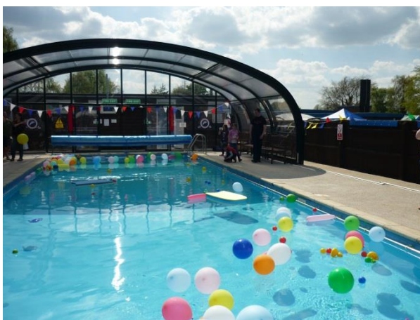
Our Swimming Pool

The Ladybird Pre-school moved into purpose built premises on our site in February 2014. Although the Ladybird Pre-school is run independently from St. Andrew's CE Primary School, we work in close partnership with the pre-school for the benefit of all children and the majority of the children transfer directly from Ladybird Pre-school into St. Andrew's Foundation Stage.