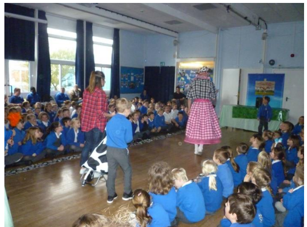
Parents join in Literacy Fortnight