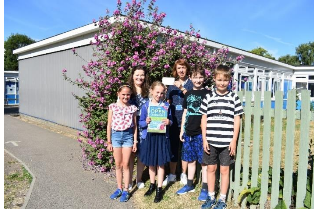
The Gardening Club

These are some of the clubs/activities which have taken place over the last year: Netball, Gardening, Puzzle, Drama, Dance, Choir, Library, ICT, Science.