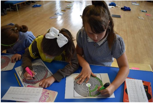
Maths teaching in Key Stage 1