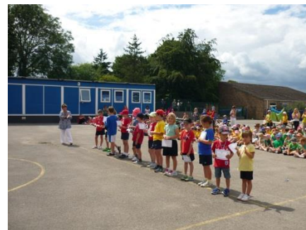
Sports Personality of the Year

St. Andrew's is fortunate to have the Chinnor Community Swimming Pool within the campus. All our children have swimming lessons as part of the PE curriculum from April through to the end of October. The swimming pool is also used by three local schools and community swimming lessons take place after school in the summer months.