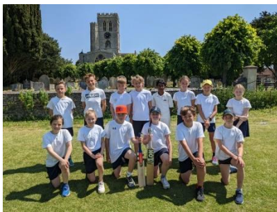
Thame Cricket Tournament