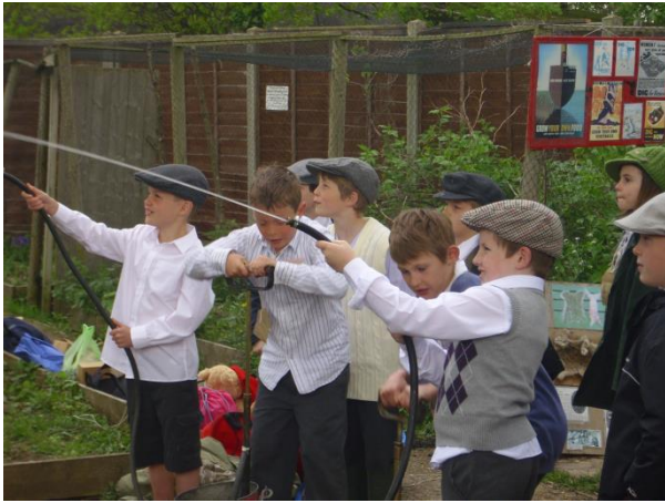
Year 3 visit Lincolnshire Field

Musical productions are also a popular feature of our curriculum provision. As well as achieving Healthy School Status and Activemark, we have been awarded Artsmark GOLD for our commitment to the arts – dance, drama, creative writing, art and music.