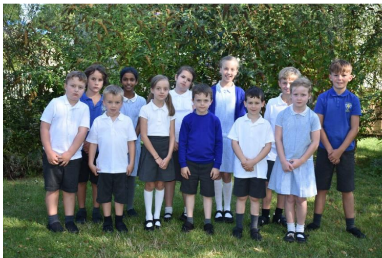
The School Council