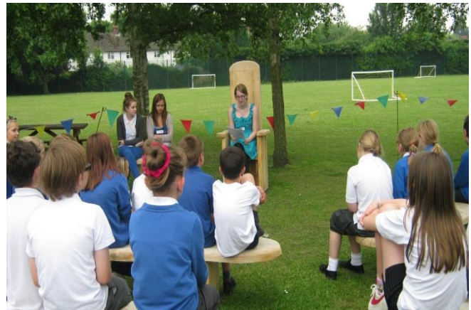
Sixth form students from LWS at St. Andrew's