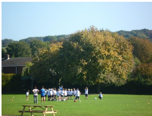
PE on our field