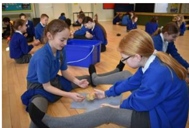
Chicks in School