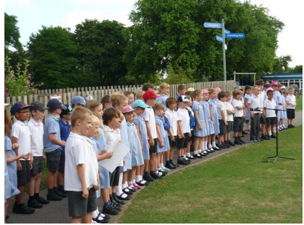
The whole school 'Thank you' service in the Spiritual Garden