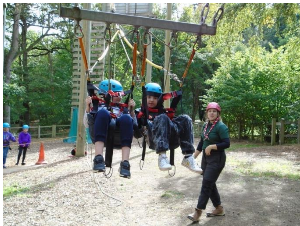
Year 5 at Youlbury Residential

There is an opportunity for Year 6 pupils to go on an annual residential visit to a Kingswood Adventure Park in Term 1. Year 5 pupils visit Youlbury Camp, outside Oxford in September for two nights, as preparation for the Year 6 trip.