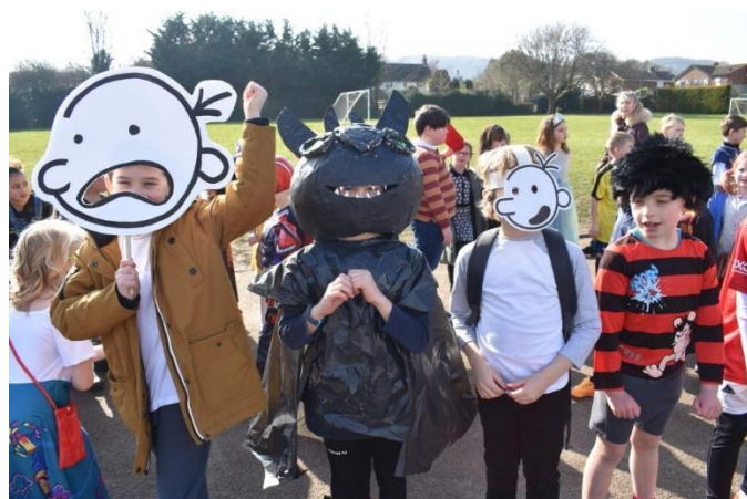
World Book Day