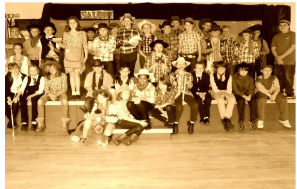
Year 6 Production 'Yahoo!'

Year 4 pupils are given the opportunity to become Junior Leaders; taking on a role of responsibility during lunchtimes. Year 5 pupils are offered Play Leader roles at breaktime and at lunchtime. Their role is to lead playtime games and to encourage younger children to join in. In year 6, the children can become Well-Being Ambassadors and support others with any worries they may have in school.