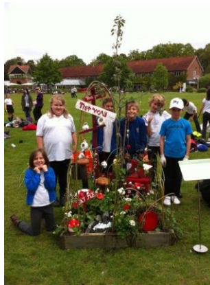
The Gardening club wins 'Best Decorated Garden' at RHS Wisley June 2015

If they so wish, parents may withdraw their children from Collective Worship and Religious Education lessons. Members of staff also have the right to withdraw. Children who are withdrawn will be set some work to do under the supervision of an adult. If there are any concerns, you are encouraged to contact the Headteacher.