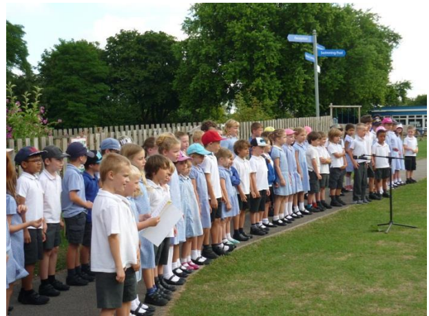
The whole school 'Thank you' service in the Spiritual Garden