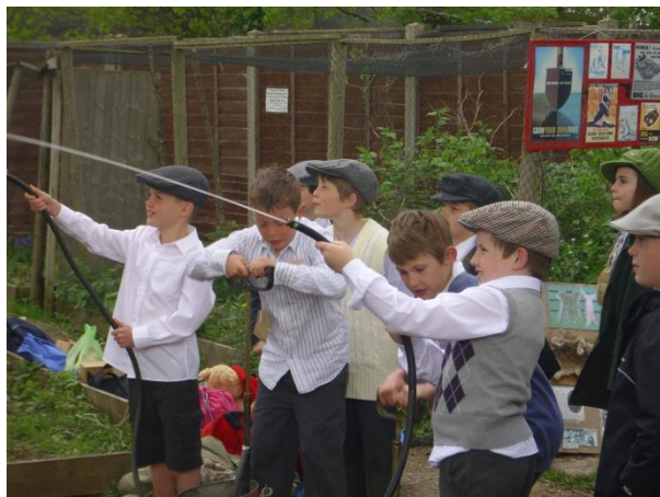
Year 3 visit Lincolnsfield

Musical productions are also a popular feature of our curriculum provision. As well as achieving Healthy School Status and Activemark, we have been awarded Artsmark GOLD for our commitment to the arts – dance, drama, creative writing, art and music.