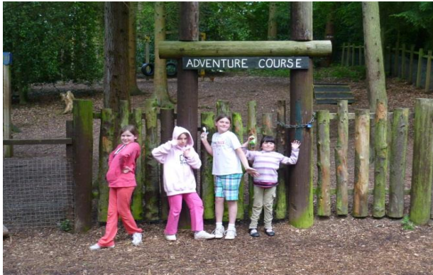
Year 5 at Youlbury, Oxfordshire