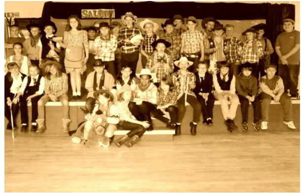
Year 6 production 'Yahoo!'

Year 5 pupils have the opportunity to become Play Leaders at breaktime and at lunchtime. Their role is to lead playtime games and to encourage younger children to join in.