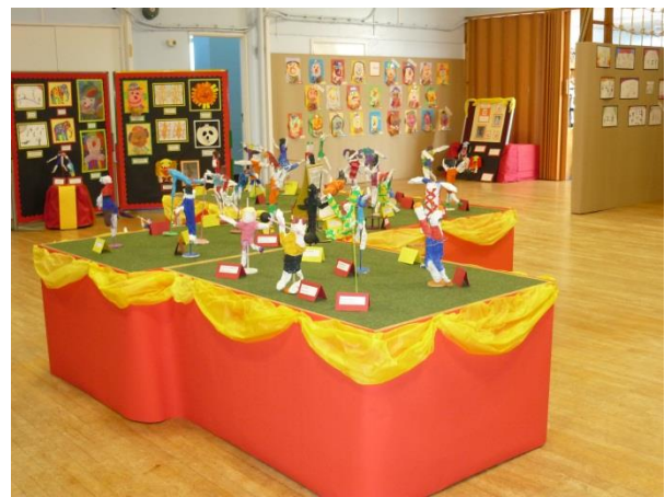
Children's art work displayed in the gallery

There is an opportunity for Year 6 pupils to go on an annual residential visit to Colomendy in North Wales in November. Year 5 pupils visit Youlbury Camp, outside Oxford in April for two nights, as a preparation for the Year 6 trip.