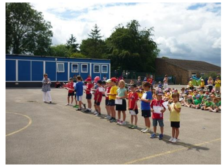
Sports Personality of the Year

St. Andrew's is fortunate to have the Chinnor Community Swimming Pool within the campus. All our children have swimming lessons as part of the PE curriculum from April through to the end of October. The swimming pool is also used by three local schools and community swimming lessons take place after school in the summer months.