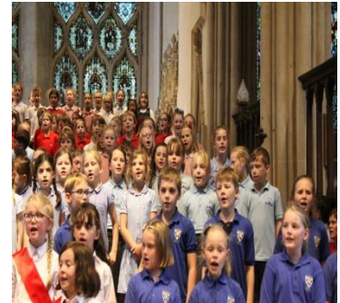
The Choir at Dorchester

Musical productions are also a popular feature of our curriculum provision. As well as achieving Healthy School Status and Activemark, we have been awarded Artsmark GOLD for our commitment to the arts – dance, drama, creative writing, art and music.