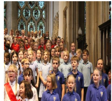
The Choir at Dorchester

Musical productions are also a popular feature of our curriculum provision. As well as achieving Healthy School Status and Activemark, we have been awarded Artsmark GOLD for our commitment to the arts – dance, drama, creative writing, art and music.