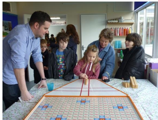
The Christmas Fayre