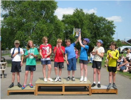
Phoenix House wins Sports Day