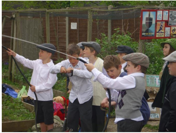
Year 3 visit Lincolnsfield