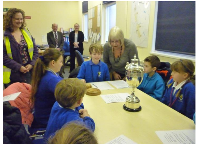
A visit to the Parish Council