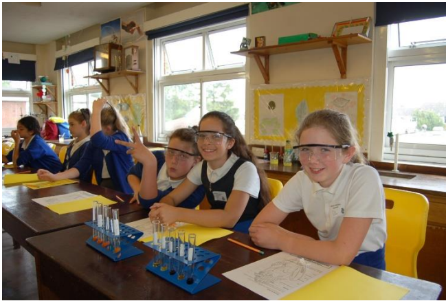
Year 6 pupils at Lord Williams's School