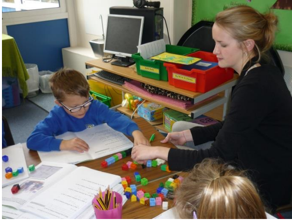
Maths teaching in Key Stage 1