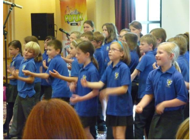
Performing at the Oxford Diocese Headteachers' Conference

As far as possible, we aim to organise our classes into single year groups. However, because numbers are rising due to the school's popularity, occasionally, we may need to have mixed-age groups in the same class. When this does happen, we plan even more carefully to ensure that the work set matches the child's ability.