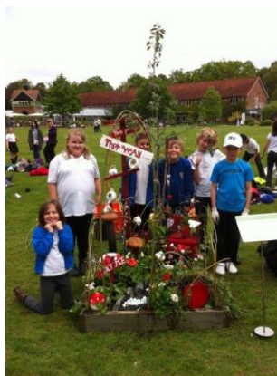
The Gardening club wins 'Best Decorated Garden' at RHS Wisley June 2015

If they so wish, parents may withdraw their children from Collective Worship and Religious Education lessons. Members of staff also have the right to withdraw. Children who are withdrawn will be set some work to do under the supervision of an adult. If there are any concerns, you are encouraged to contact the Headteacher.