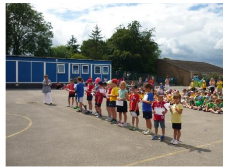
Sports Personality of the Year

St. Andrew's is fortunate to have the Chinnor Community Swimming Pool within the campus. All our children have swimming lessons as part of the PE curriculum from April through to the end of October. The swimming pool is also used by three local schools and community swimming lessons take place after school in the summer months.