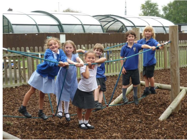
Playtime in the adventure playground