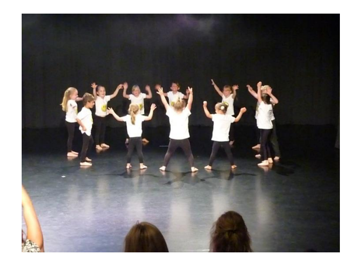
EYFS at the Thame Dance Festival