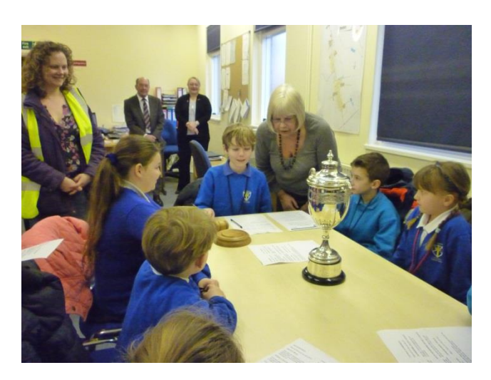
A visit to the Parish Council