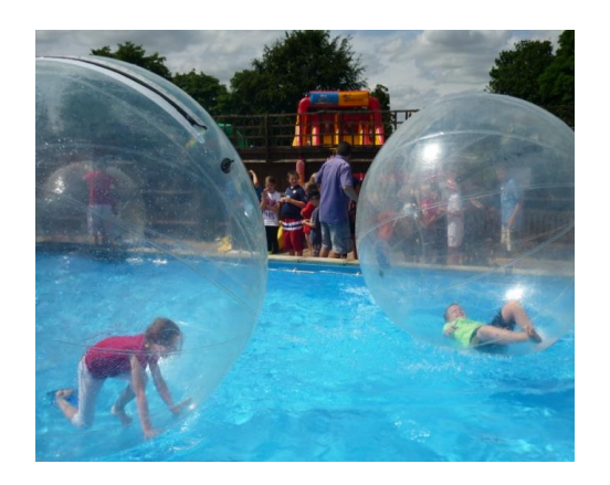
Fun in the pool