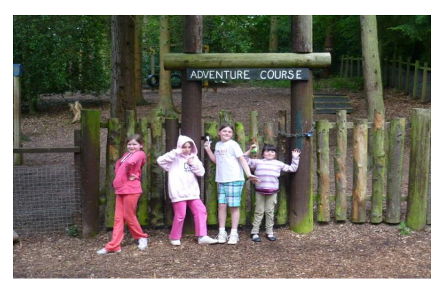
Year 5 at Youlbury, Oxfordshire

There is an opportunity for Year 6 pupils to go on an annual residential visit to Colomendy in North Wales in November. Year 5 pupils visit Youlbury Camp, outside Oxford in September for two nights, as preparation for the Year 6 trip.