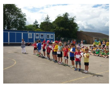
Phoenix House wins Sports Day