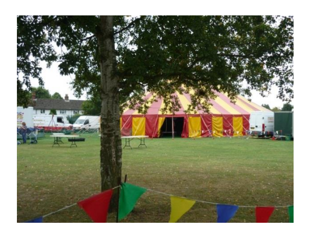
The circus comes to St. Andrew's

The committee are always looking for people to join them or to train as lifeguards. If you would like to help or if you have any questions at all please do not hesitate to get in touch either via the website or by leaving a message at the School Office.