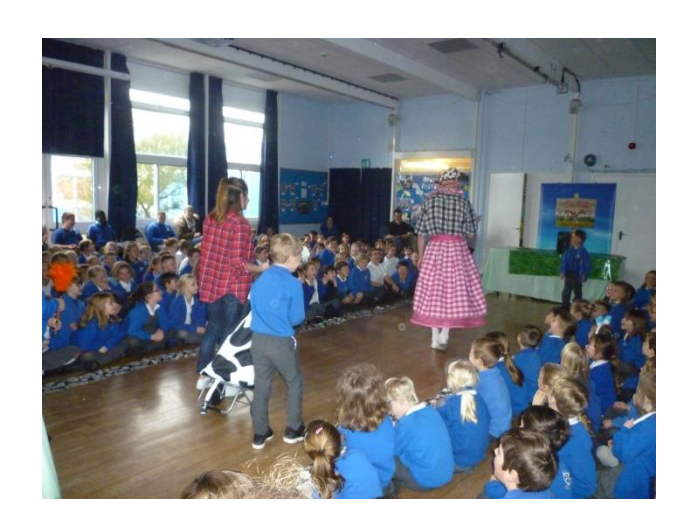
Parents join in Literacy Fortnight