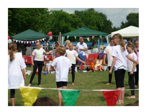
The Summer Carnival