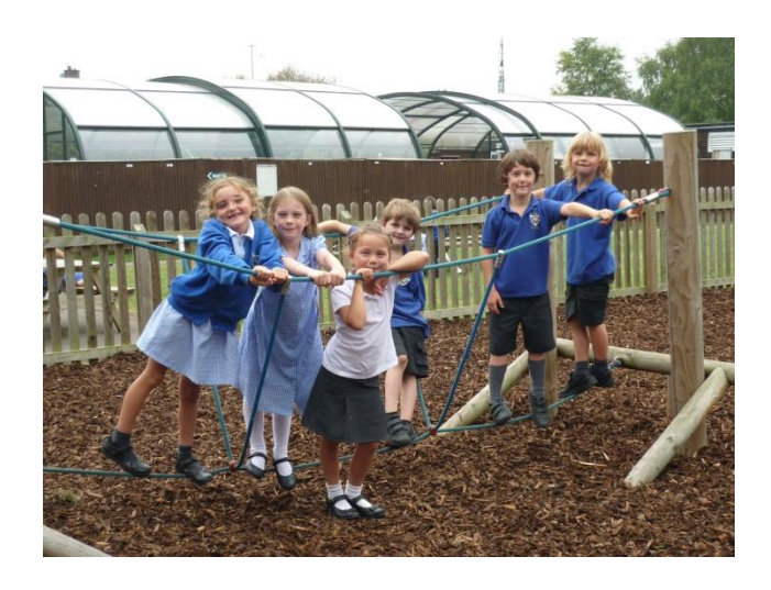
Playtime in the adventure playground