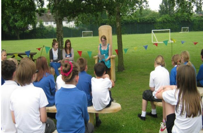
Year 6 pupils at Lord Williams's School