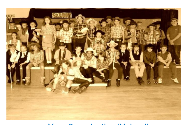
Year 6 production 'Yahoo!'

Year 4 pupils are given the opportunity to become Junior Leaders, taking on a role of responsibility during lunchtimes. Year 5 pupils are offered Play Leader roles at breaktime and at lunchtime. Their role is to lead playtime games and to encourage younger children to join in. In year 6, the children can become Well-Being Ambassadors and support others with any worries they may have in school.