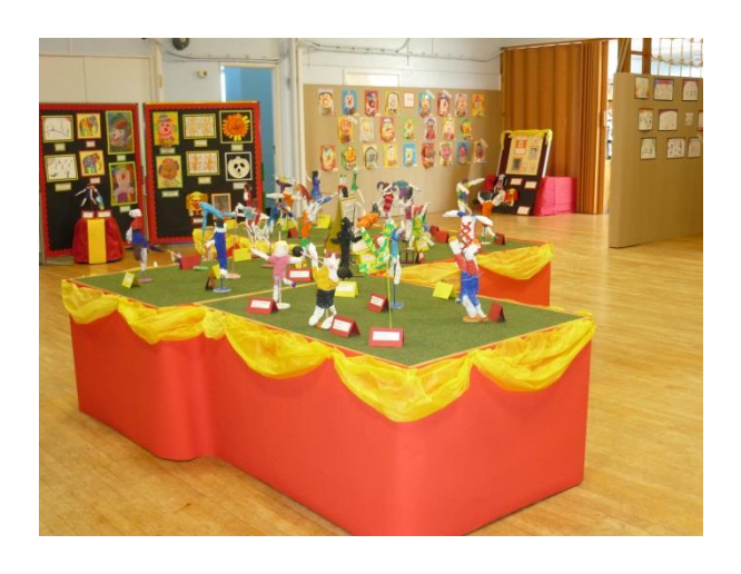
Children's art work displayed in the gallery

There is an opportunity for Year 6 pupils to go on an annual residential visit to Colomendy in North Wales in November. Year 5 pupils visit Youlbury Camp, outside Oxford in September for two nights, as preparation for the Year 6 trip.