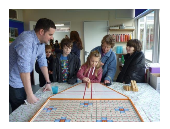
The Christmas Fayre