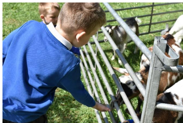
A farm in school