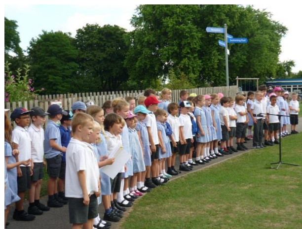
The whole school 'Thank you' service in the Spiritual Garden