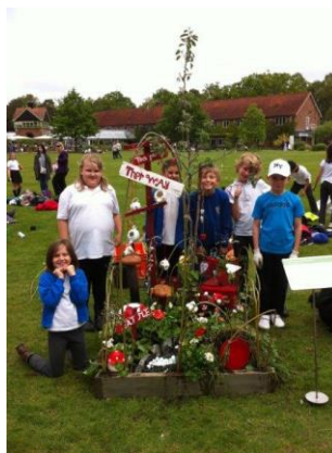
The Gardening club wins 'Best Decorated Garden' at RHS Wisley June 2015

If they so wish, parents may withdraw their children from Collective Worship and Religious Education lessons. Members of staff also have the right to withdraw. Children who are withdrawn will be set some work to do under the supervision of an adult. If there are any concerns, you are encouraged to contact the Headteacher.