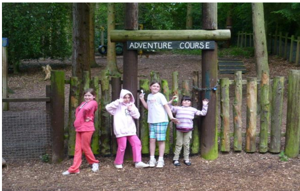
Year 5 at Youlbury, Oxfordshire

There is an opportunity for Year 6 pupils to go on an annual residential visit to Colomendy in North Wales in November. Year 5 pupils visit Youlbury Camp, outside Oxford in September for two nights, as preparation for the Year 6 trip.