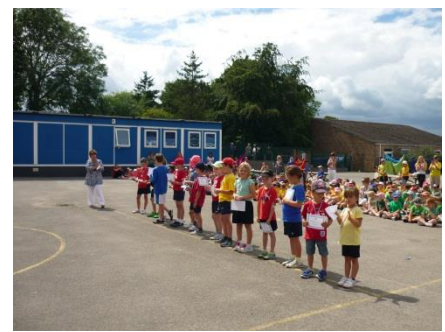
Sports Personality of the Year

St. Andrew's is fortunate to have the Chinnor Community Swimming Pool within the campus. All our children have swimming lessons as part of the PE curriculum from April through to the end of October. The swimming pool is also used by three local schools and community swimming lessons take place after school in the summer months.