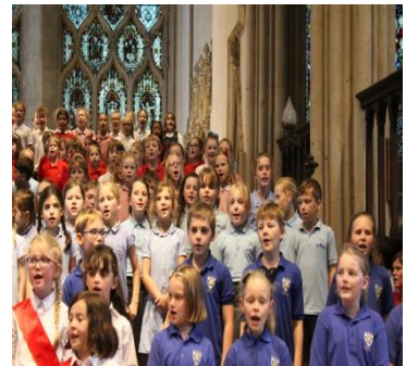
The Choir at Dorchester

Musical productions are also a popular feature of our curriculum provision. As well as achieving Healthy School Status and Activemark, we have been awarded Artsmark GOLD for our commitment to the arts – dance, drama, creative writing, art and music.