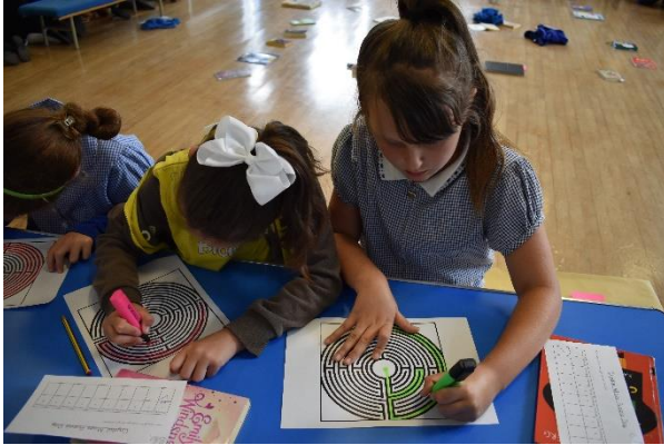
Maths teaching in Key Stage 1