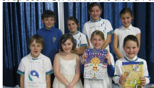
The MAD Club Tuck Shop