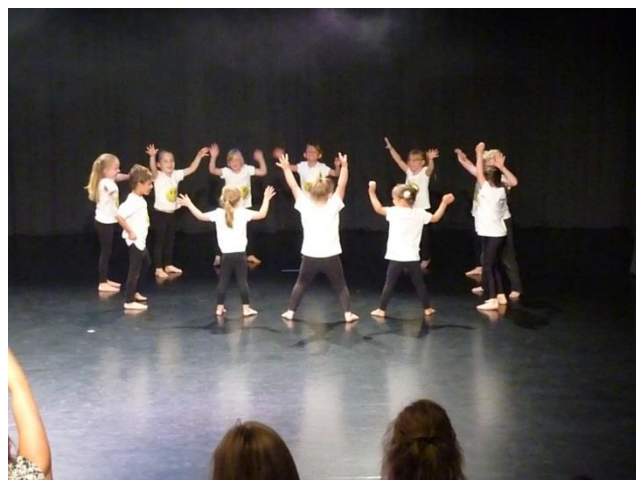
EYFS at the Thame Dance Festival