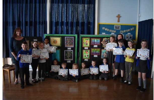
Art exhibition of children's work

As far as possible, we aim to organise our classes into single year groups. However, because numbers are rising due to the school's popularity, occasionally, we may need to have mixed-age groups in the same class. When this does happen, we plan even more carefully to ensure that the work set matches the child's ability.