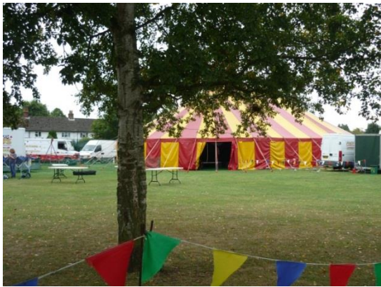
The circus comes to St. Andrew's

The committee are always looking for people to join them or to train as lifeguards. If you would like to help or if you have any questions at all please do not hesitate to get in touch either via the website or by leaving a message at the School Office.