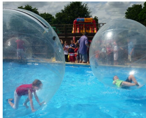
Fun in the pool