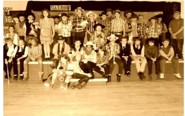
Year 6 production 'Yahoo!'

Year 4 pupils are given the opportunity to become Junior Leaders, taking on a role of responsibility during lunchtimes. Year 5 pupils are offered Play Leader roles at breaktime and at lunchtime. Their role is to lead playtime games and to encourage younger children to join in. In year 6, the children can become Well-Being Ambassadors and support others with any worries they may have in school.