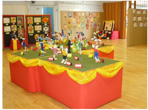
Children's art work displayed in the gallery

There is an opportunity for Year 6 pupils to go on an annual residential visit to Colomendy in North Wales in November. Year 5 pupils visit Youlbury Camp, outside Oxford in September for two nights, as preparation for the Year 6 trip.