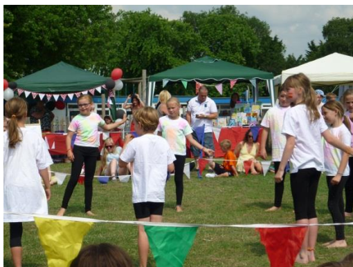
The Summer Carnival