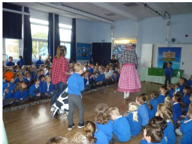
Parents join in Literacy Fortnight