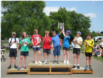
Phoenix House wins Sports Day