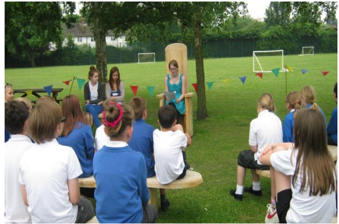
Sixth form students from LWS at St. Andrew's