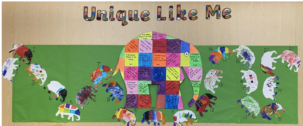
EYFS display board