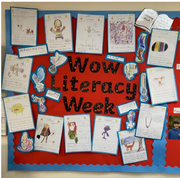
KS1 display board