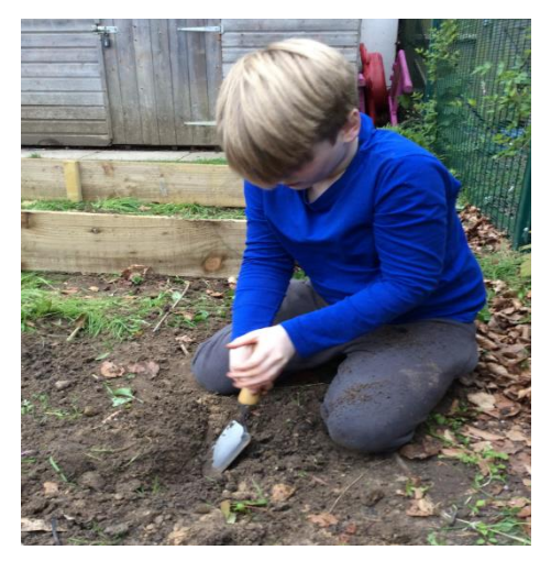
Copper class have been creating a gardening area in their outdoor area. This is thanks to a grant from Chinnor Beer Festival. Copper class promise more photos and updates to follow!