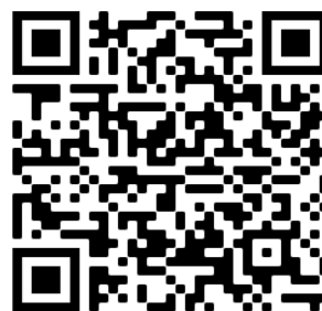
QR code for webpage