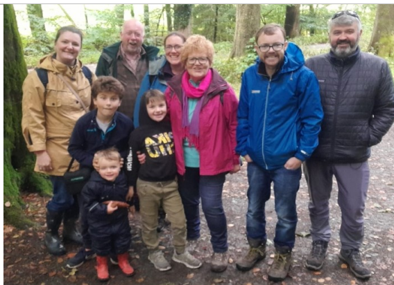
All the family