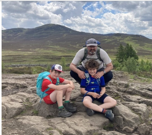
Walking with Dad