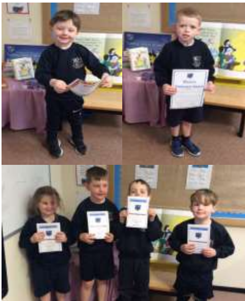
Our EYFS reading superstars

Children in Early Years Foundation Stage have been applying their phonic skills as some have achieved reading awards for reading 15 books! Well done children, what little bookworms you are! Keep going!