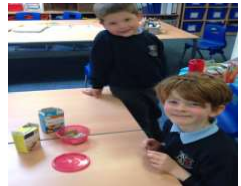
Year 1 playing Ce'real' or Nonsense words

out @phonicsfamily on Instagram for original ideas without compromising on fun.