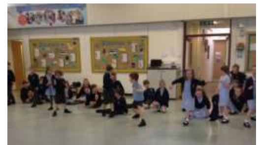
Ready, steady, go!

Year 2 have also been having fun whilst learning. They practised their spellings by playing Phonics Relay. What a great way of consolidating the phonemes they had been learning in their lessons. Well done Year 2!