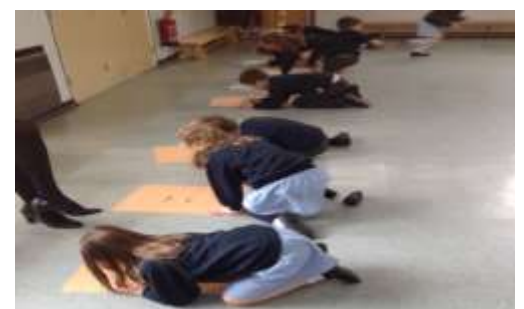
Quickly writing the word!