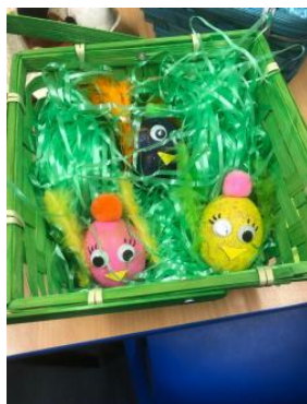
YR3- Grace – Chicks