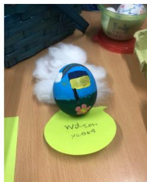
YR4 – Wilson Peace for Ukraine