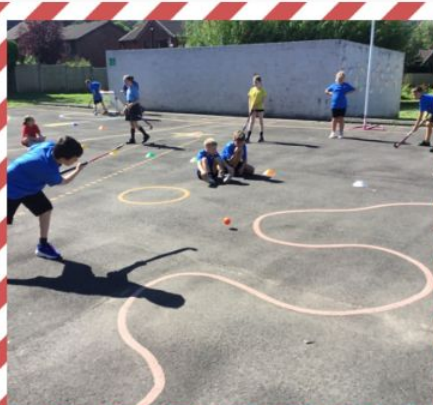
PASSING AND RECEIVING IN HOCKEY