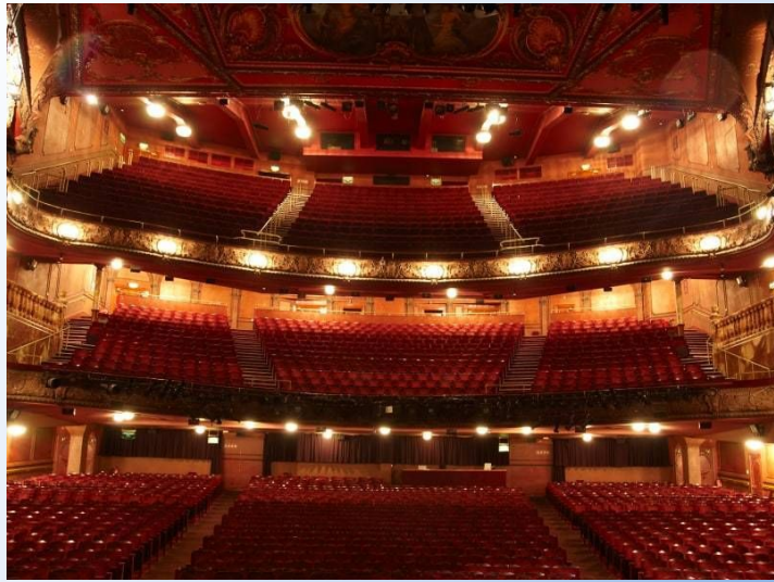
West End Show- TBC