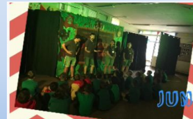
JUNGLE BOOK PERFORMANCE AND WORKSHOP