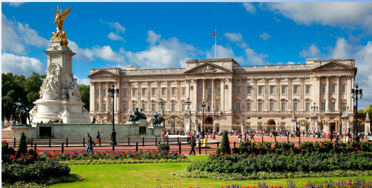
Sightseeing Tour of London