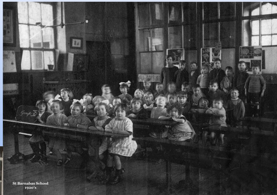
St Barnabas School 1920's