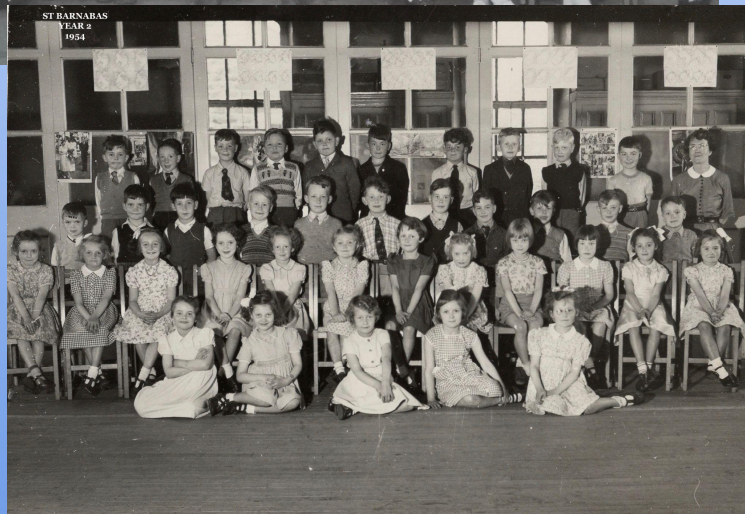
ST BARNABAS YEAR 2 1924