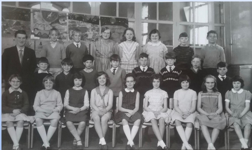
St Barnabas 1965 Top Class