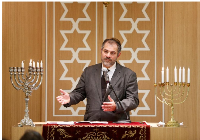
A Rabbi in a Synagogue