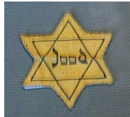
During the Holocaust Jewish people were forced to wear a yellow star on their clothes.