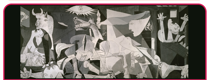
Pablo Picasso A Spanish artist who co-founded the Cubism art movement with artist Georges Braque in 1909.

Cubism ignores perspective and artists paint their subjects from lots of different angles.