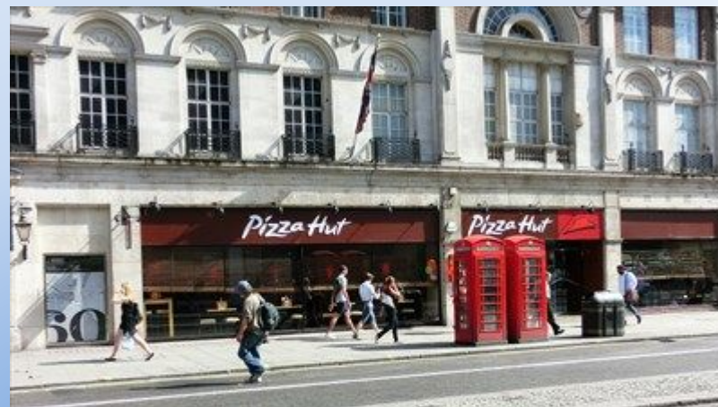
Pizza Hut Buffet