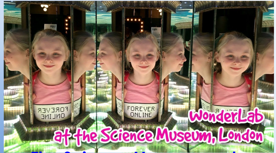
The Science Museum and workshop