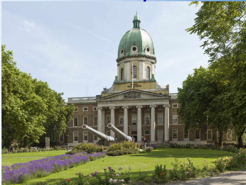
Imperial War Museum