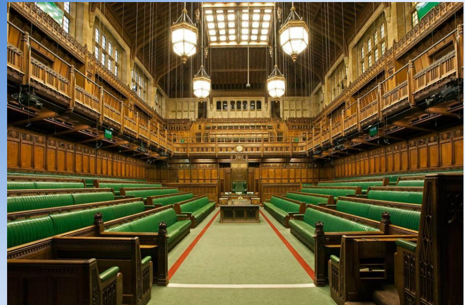
Houses of Parliament