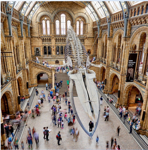
Natural History Museum